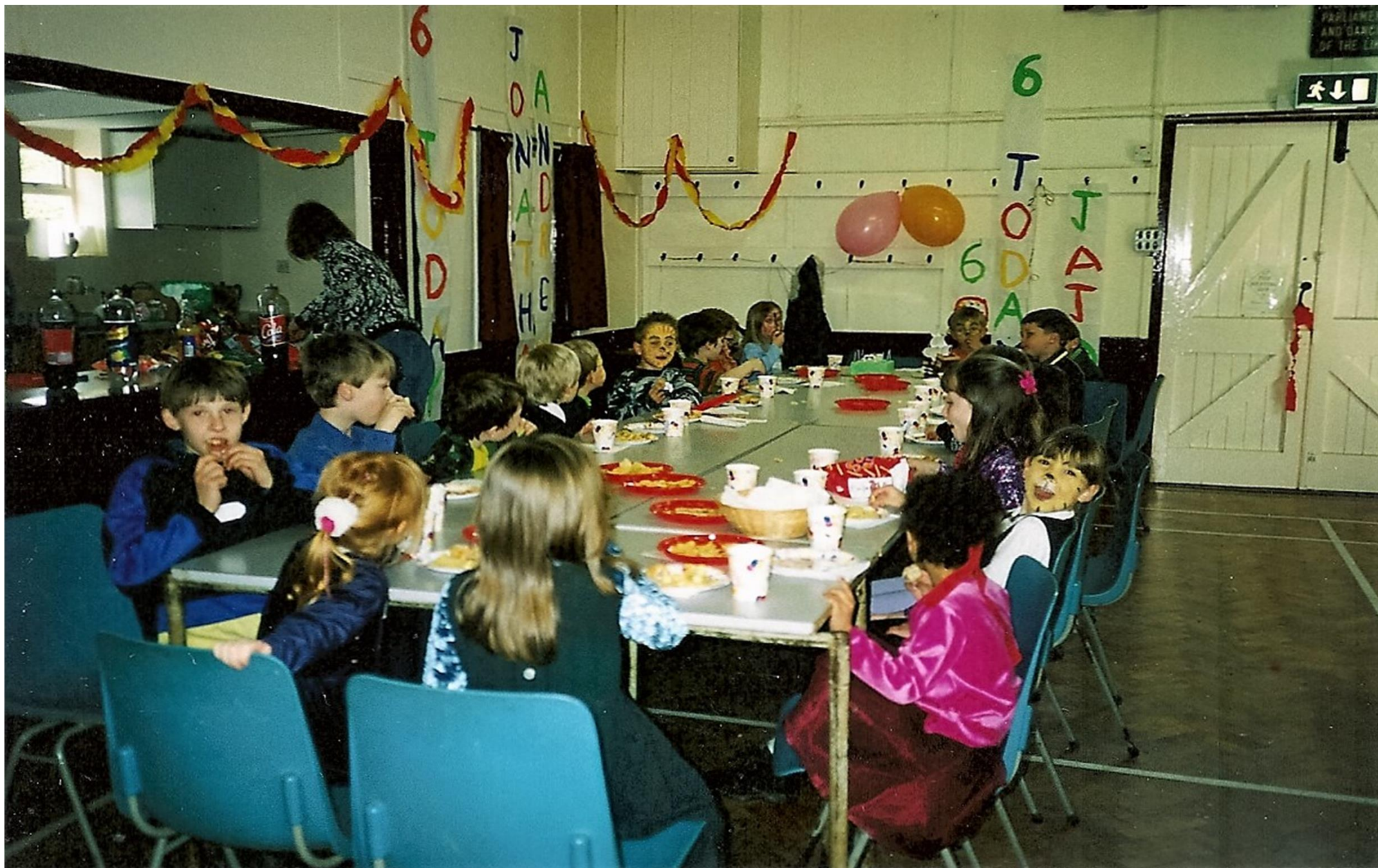
A children's party in the old hall